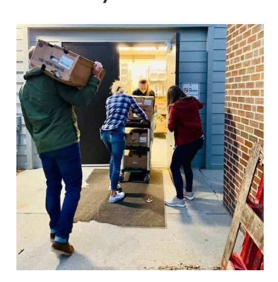
Thanksgiving 2020 is in the books. A big thank you to Storey